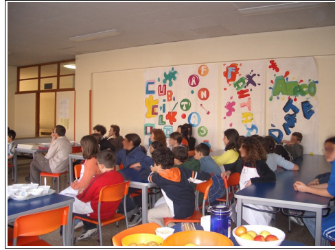
The school canteen at lunch time