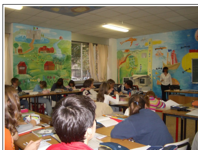
A classroom decorated by the pupils

Our facilities include large classrooms, an auditorium, a gymnasium, a canteen and a wide range of laboratories where students can get hands-on experience. Just to mention a few, there is a computer lab, an arts lab, a music lab, a science lab, a maths lab, a technology lab, a robotics lab. Most of them are equipped with updated computer facilities. The school grounds also provide grassy areas and good outdoor sporting facilities, such as a football pitch, a volleyball court and a basketball one.