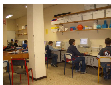
Pupils at work in the maths lab